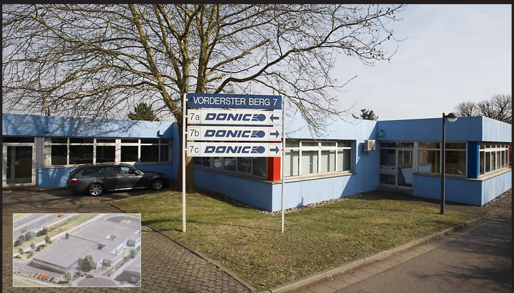
The DONIC Headquarter – Völklingen (Germany)