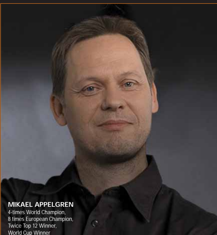
MIKAEL APPELGREN 4-Times World Champion, 8 Times European Champion, Twice Top 12 Winner, World Cup Winner