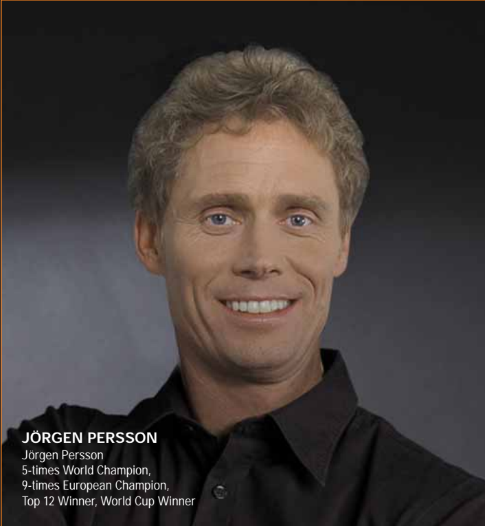
JÖRGEN PERSSON Jörgen Persson 5-Times World Champion, 9-Times European Champion, Top 12 Winner, World Cup Winner